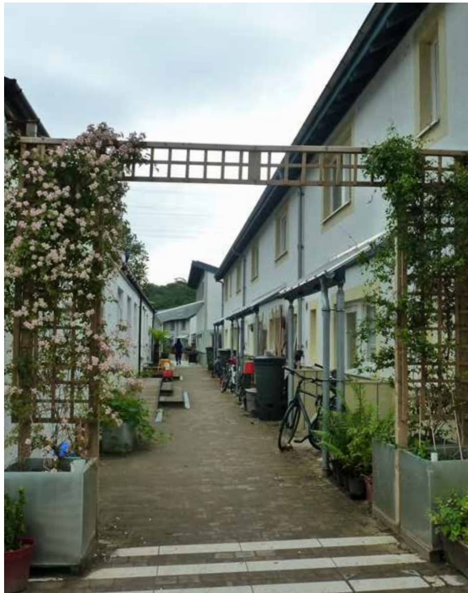
THE CENTRAL PEDESTRIAN AXIS at Lancaster Cohousing.

Lancaster Cohousing: an inter-generational cohousing community with individual houses, flats, homes, community facilities and workshop/office space. It is built on ecological values that foster environmental sustainability with new buildings achieving Passivhaus standard and meeting the requirements of Code for Sustainable Homes Level Six. http://www.lancastercohousing.org.uk/Project