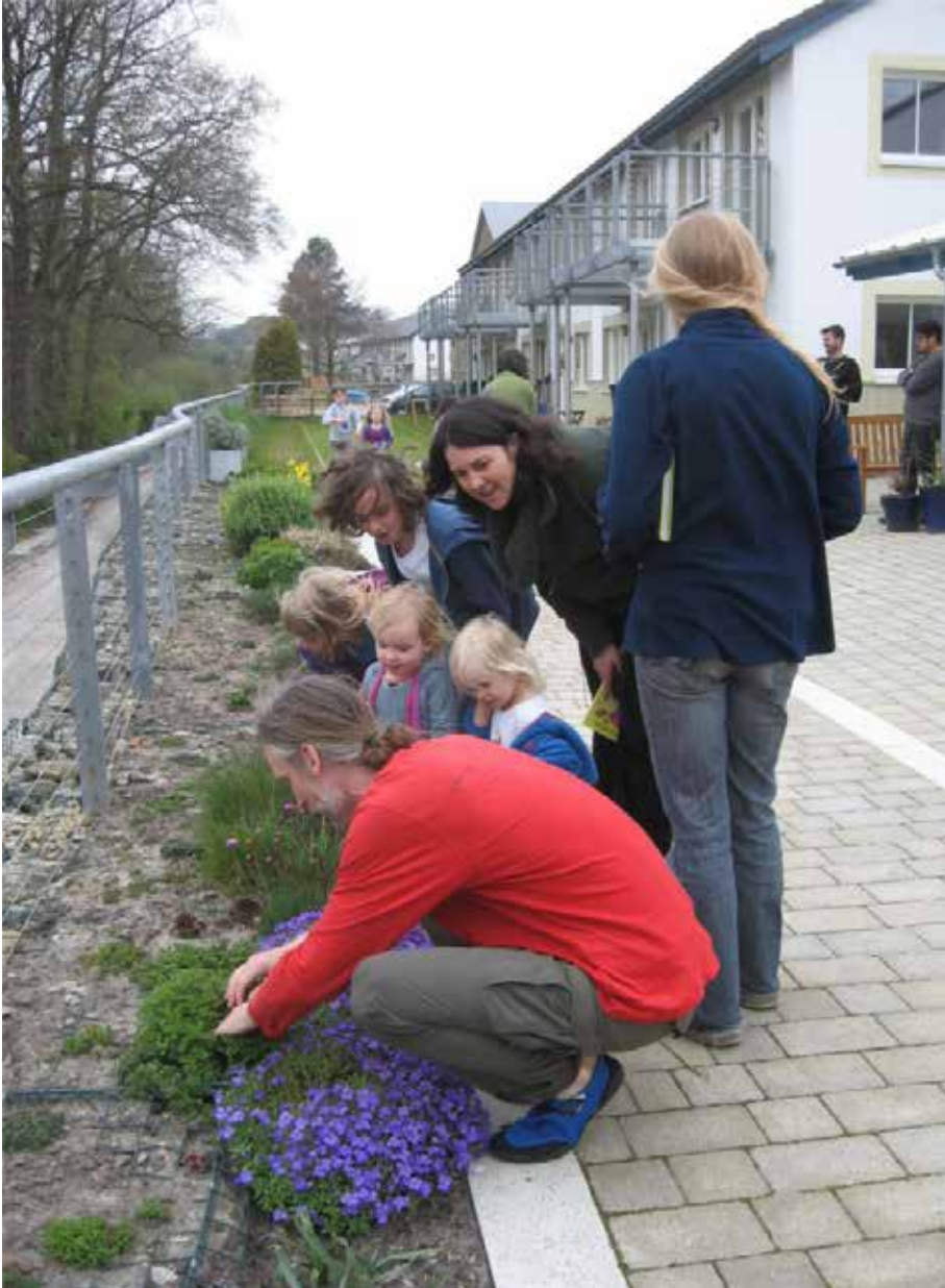
FORGE BANK COHOUSING in Lancaster, UK is an intergenerational project with high ecological standards